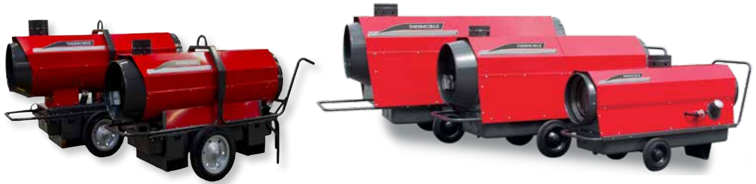
ITA 75 ROBUST