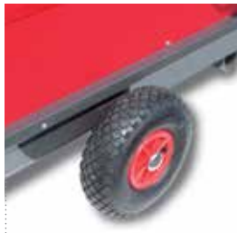
Air wheels (option).