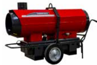
ITA 45/75 Robust lifting bracket optional.