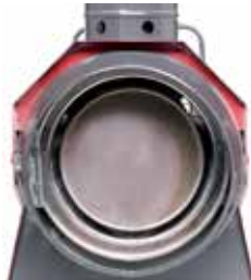
Heat exchanger ITA 35.