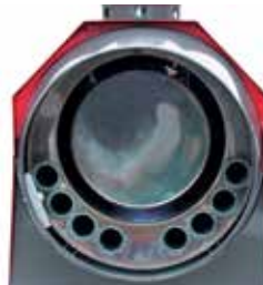
Burner chamber/heat exchanger (ITA 45/75) Thermobile achieves optimum coverage with the unique combination of stainless steel and high-temperature proof steel for the burner chamber and heat exchanger.